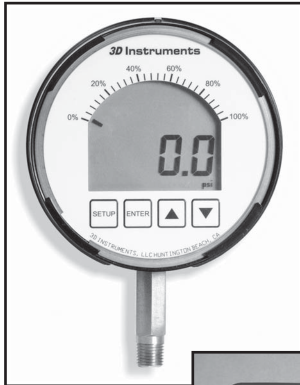
Pictured with Optional Conduit Connection