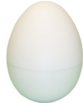
EggTemp Egg Temperature Recorder