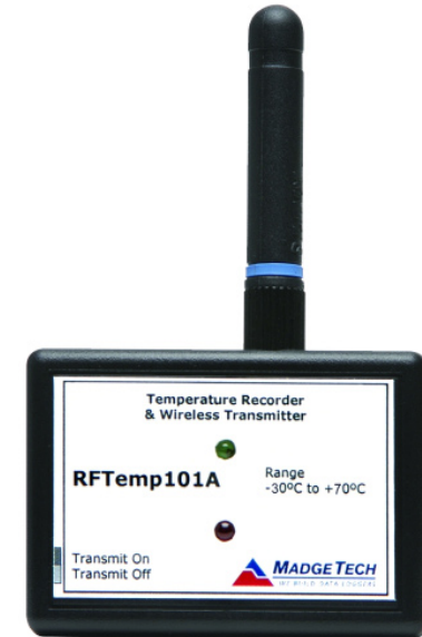
RFTemp101A Temperature Recorder and Wireless Transmitter

Specifications subject to change. See MadgeTech's terms and conditions at www.madgetech.com