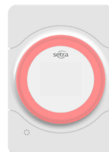
Red indicates alarm