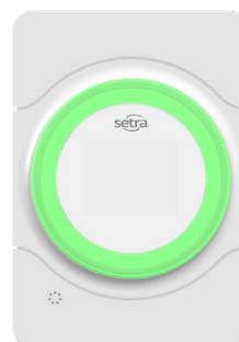
Simple green status